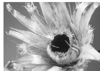
Upper left: Larinus minutus , a biological control insect used on spotted knapweed. Upper right: The damage to a spotted knapweed seed head caused by L. minutus .